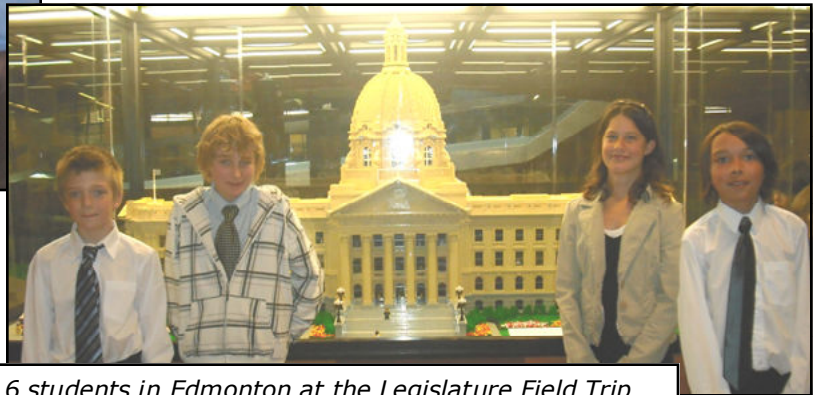
Grade 6 students in Edmonton at the Legislature Field Trip

Way to go Grade One students! Keep on reading.