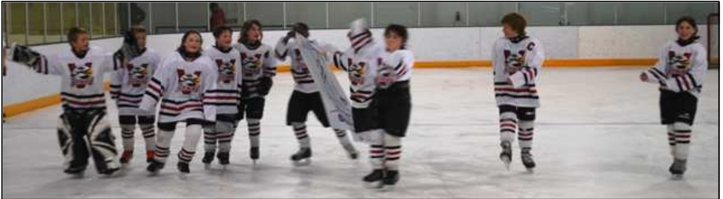
Atom Hawks skate their victory lap with the league championship banner after winning the title earlier this month.

Together we will ensure learning success for all students to develop their unique potential as caring citizens in a changing world.